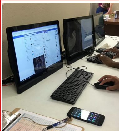
Left: Big Shout out to the American Heritage Girls for their help with Children's Express!

Thanks to Paul Nobles for teaching the computer training class!