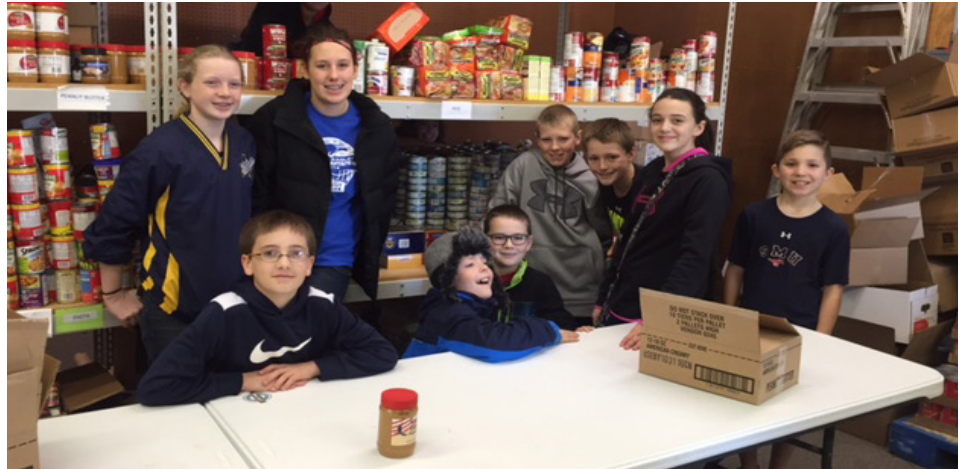
The Gunter Middle School class worked at the warehouse on Friday, January 15th. As they unpacked and shelved food, they said they unpacked 1,040 cans of tuna!