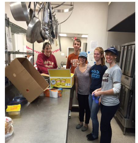
Grace Methodist Youth helped us on January 30th to make brown bag lunches.